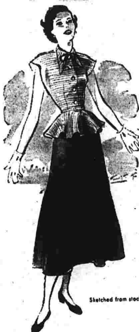
Sketched from stock

IMAGINE A GROUP OF BEAUTIFUL SPRING AND SUMMER DRESSES FOR ONLY 3.98! WHY, THEY LOOK DOLLARS MORE WITH FLATTERING STRIPED TOP AND FLARING SKIRT AS SKETCHED ABOVE. INCLUDED BUT NOT SHOWN ARE BEAUTIFUL STRIPED LUANAS, PRINTED SPUNS IN BOTH ONE AND TWO-PIECE STYLES PLUS EXTRA SIZE CHECK RAYONS! THIS IS YOUR CHANCE TO BUY AN ADVANCE SPRING AND SUMMER DRESS NOW AT ONLY 3.98. SIZES ARE 9 TO 15, 12 TO 20 AND 16½ TO 24½. ALL IN PASTEL SHADES.